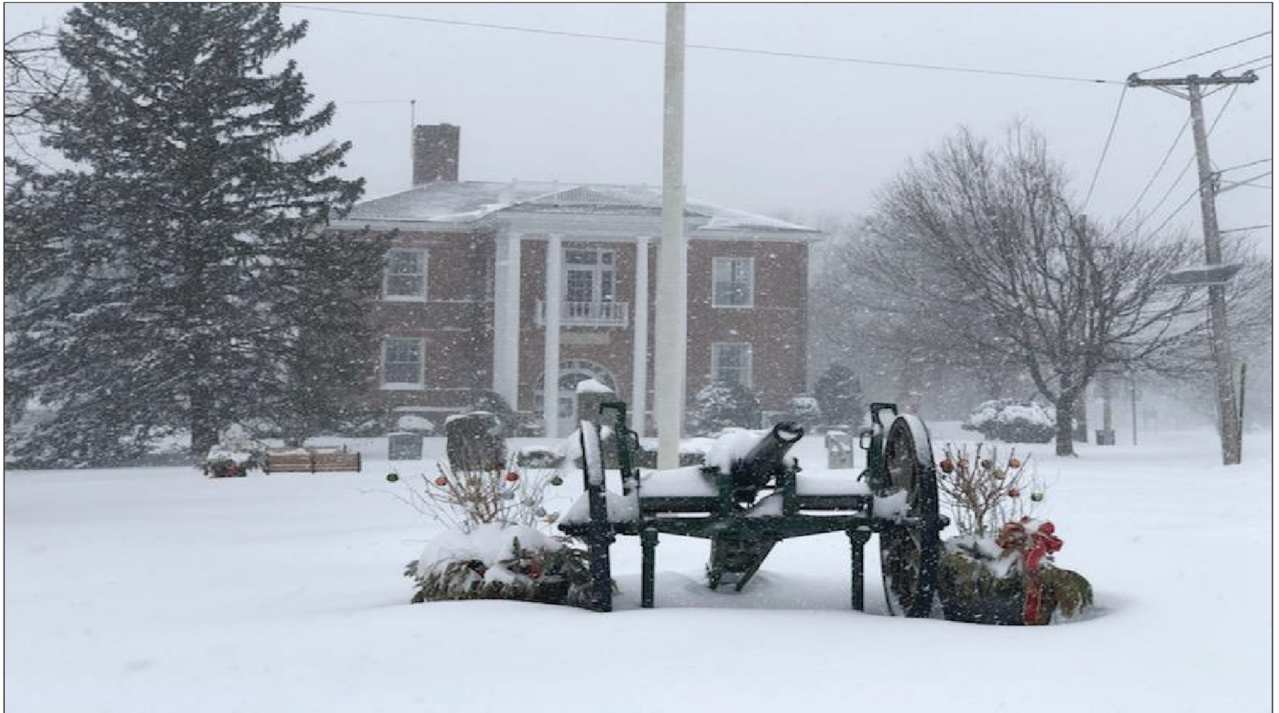
Snow Covered Borough Hall, Winter 2021