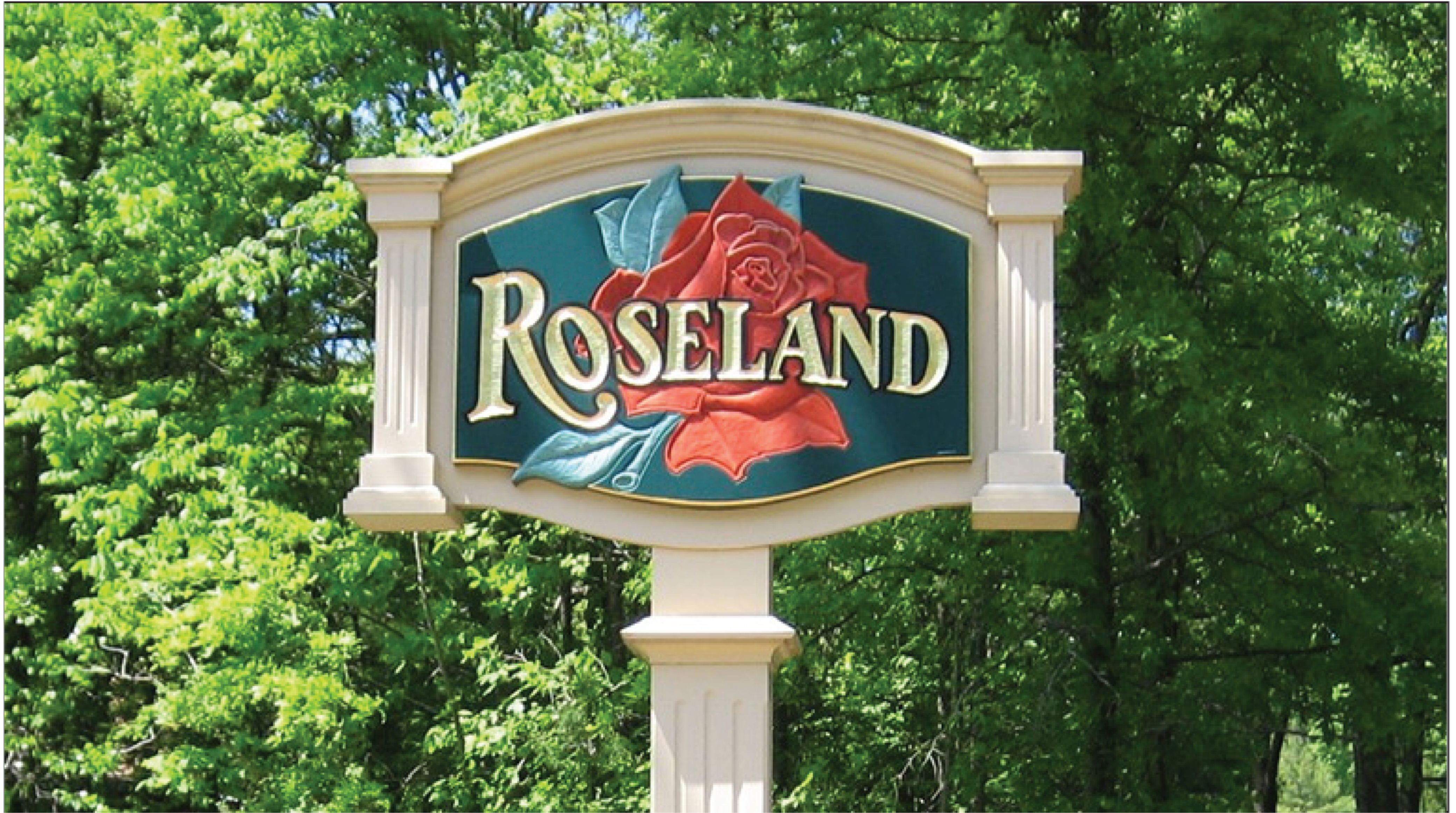
Welcome to Roseland Sign, Summer 2019

Borough of Roseland | 140 Eagle Rock Avenue | (973) 226-8080