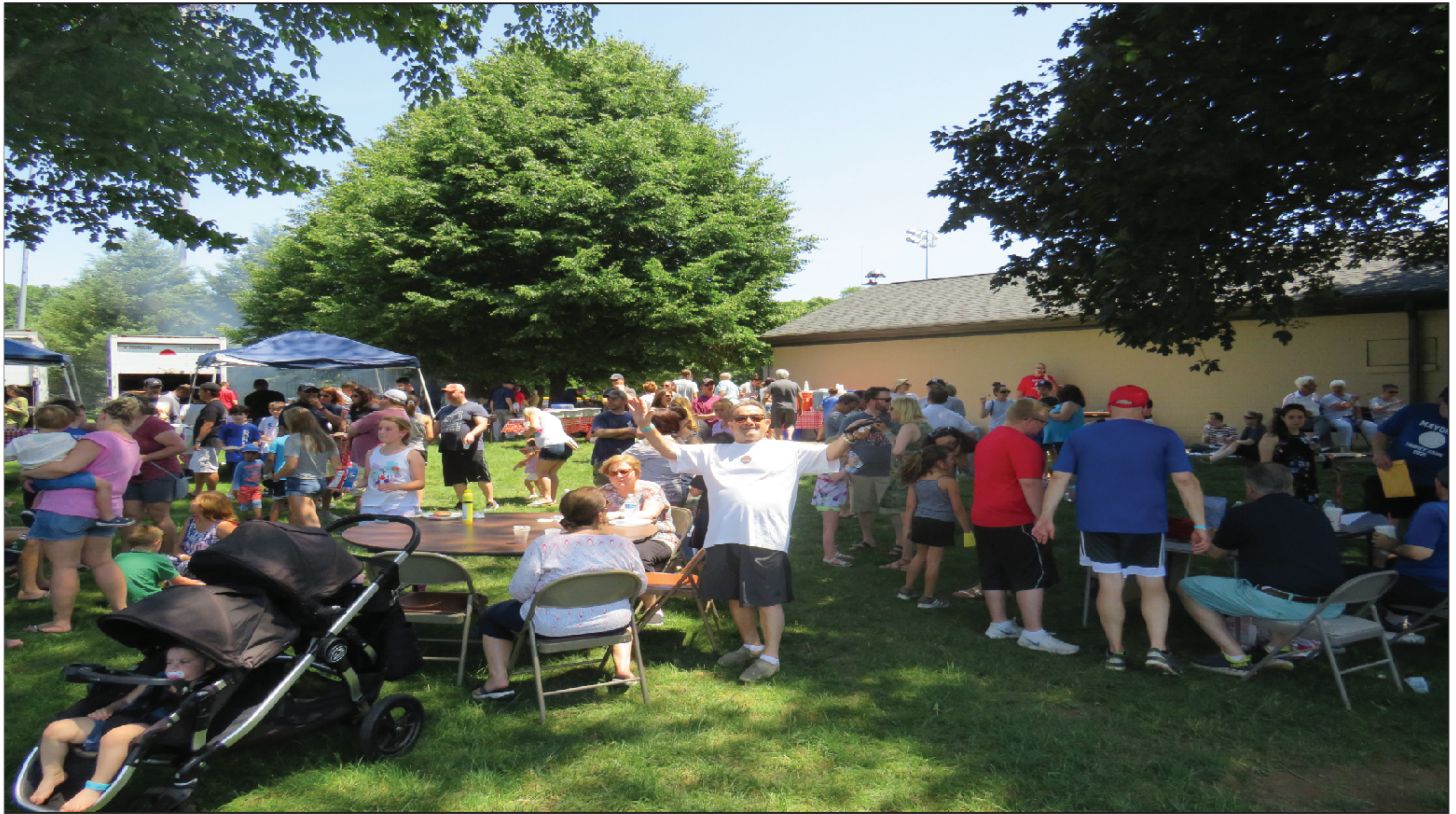
Community Picnic, June 2021