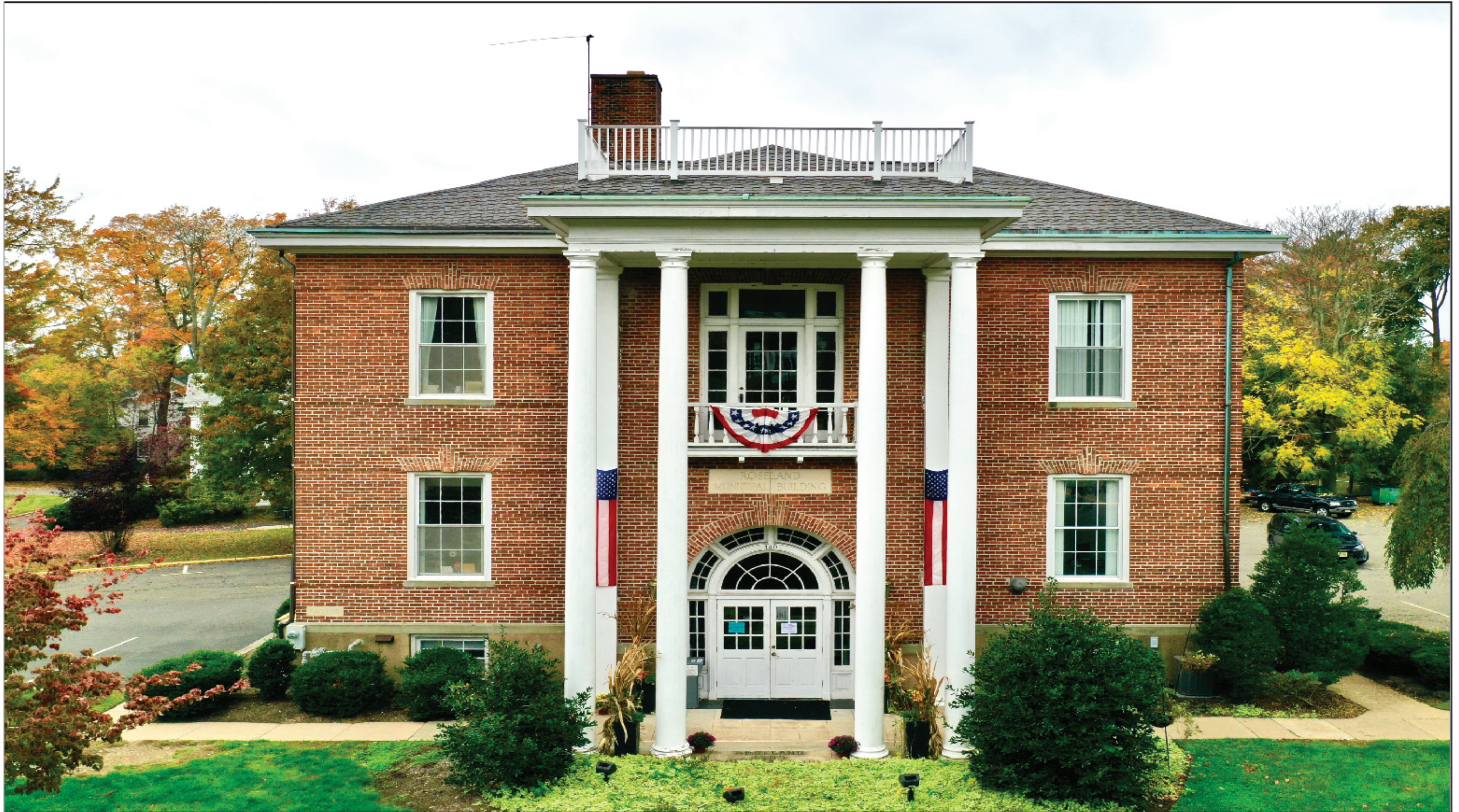
Borough Hall, October 2020