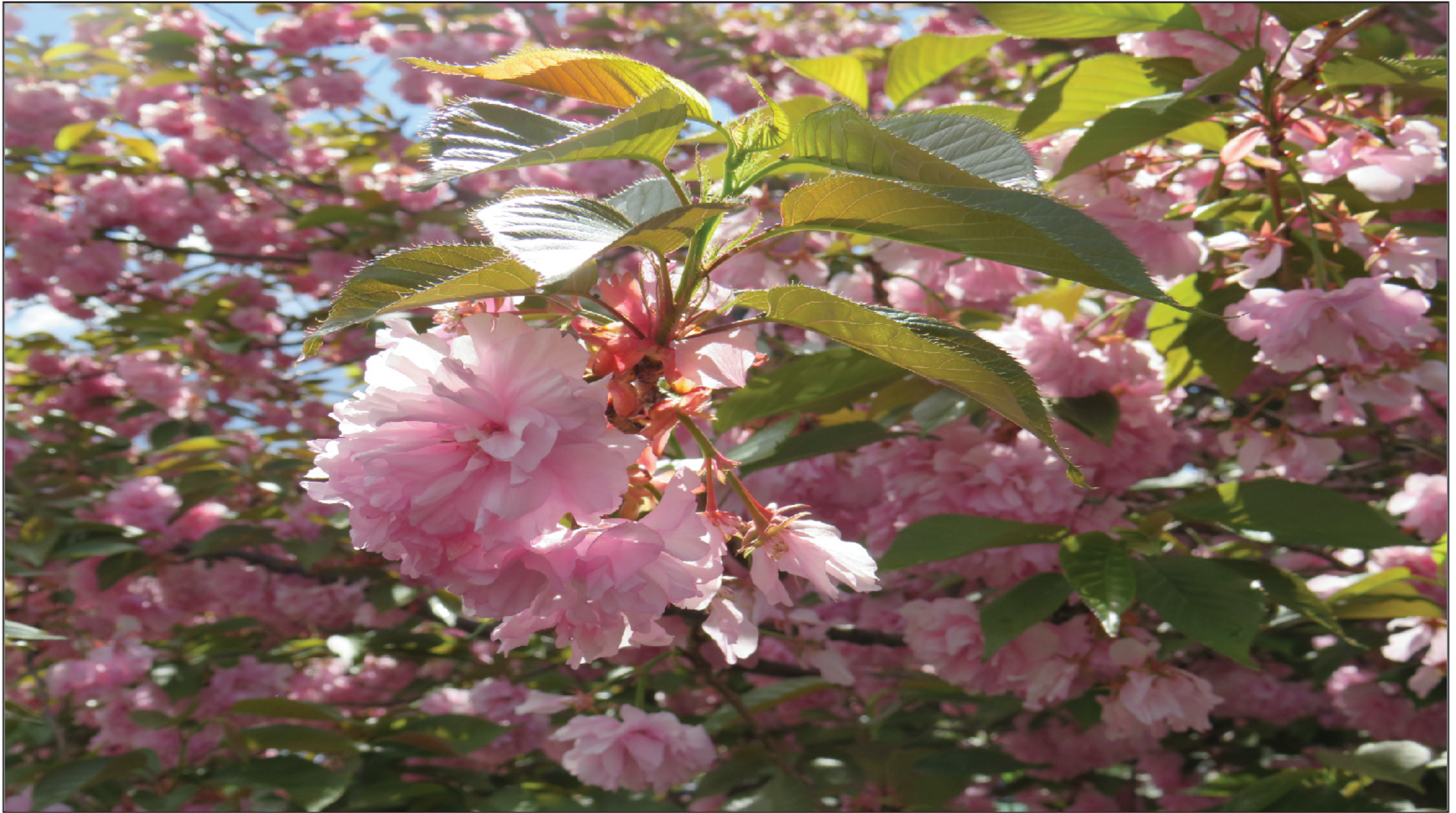
Flowering Tree by Borough Hall, Spring 2021

Borough of Roseland | 140 Eagle Rock Avenue | (973) 226-8080