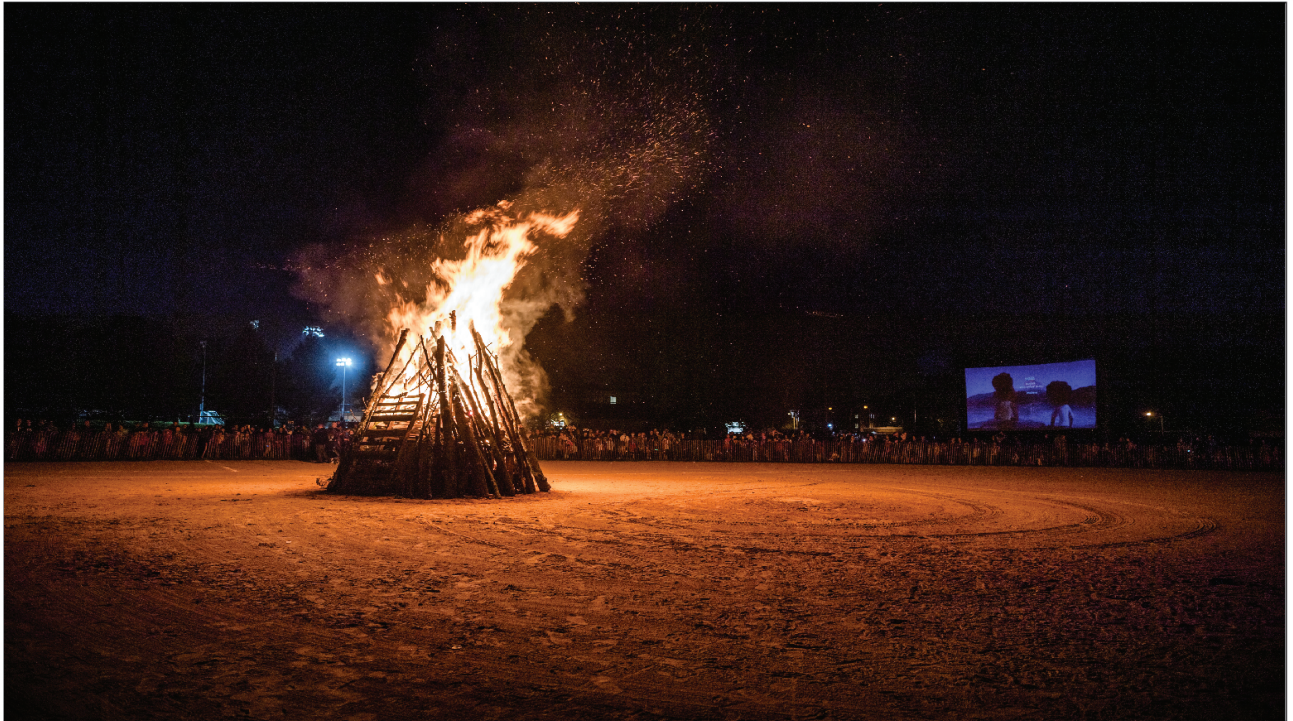
Bonfire & Movie at Roseland Day, October 2021