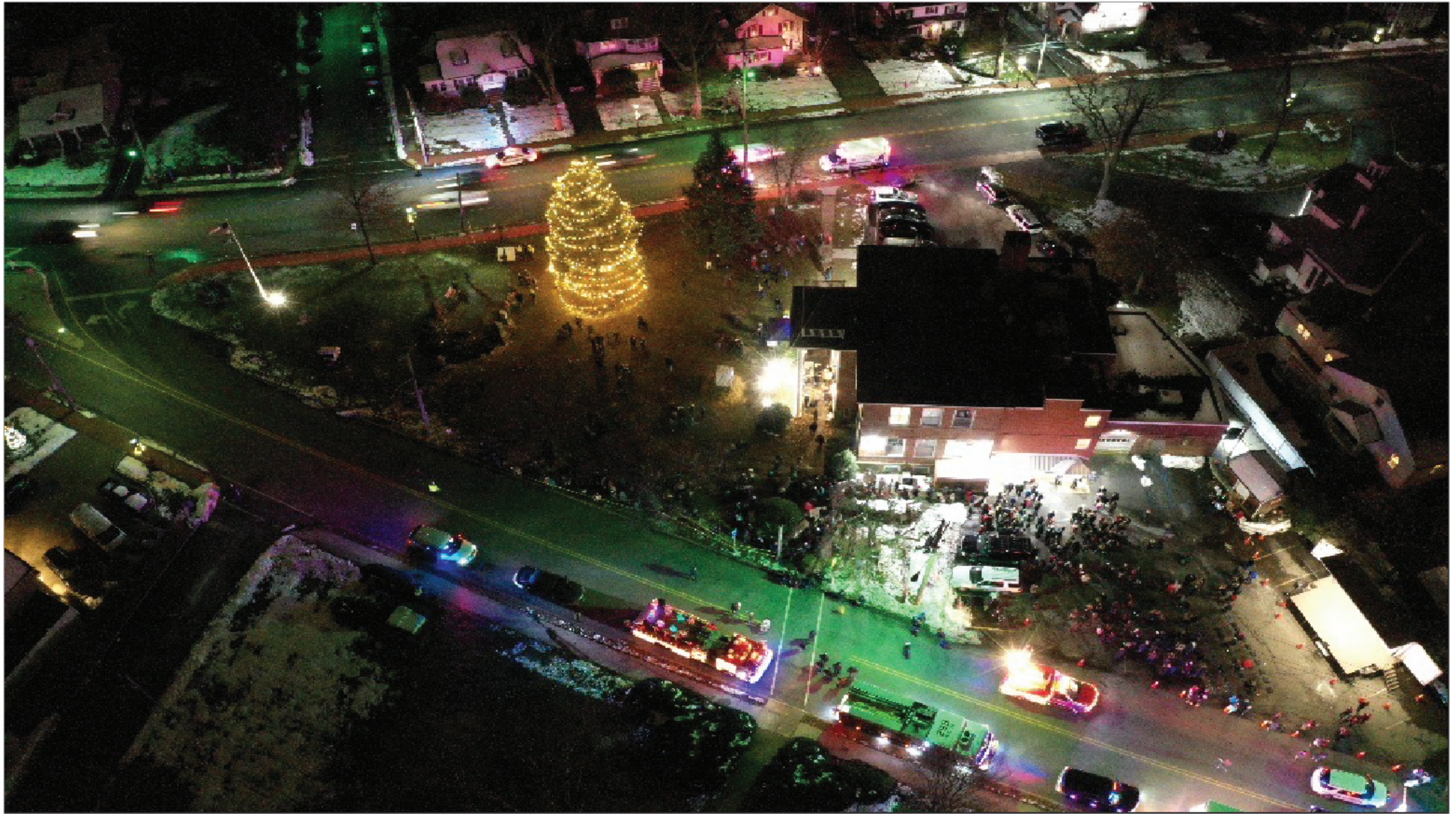
Christmas Tree Lighting Ceremony, December 2019