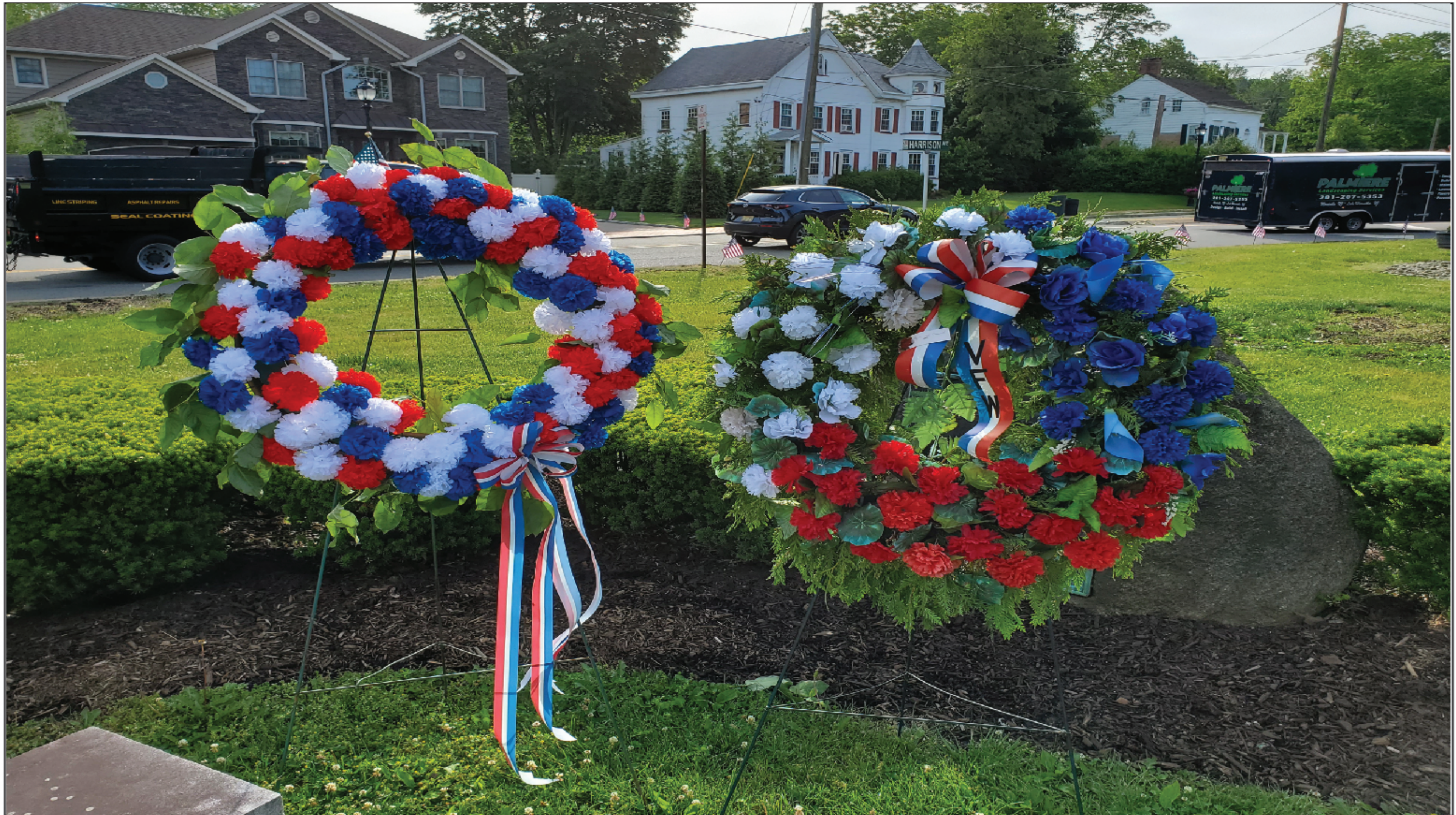
Memorial Day Wreaths in Roseland's Monument Park - May 2021