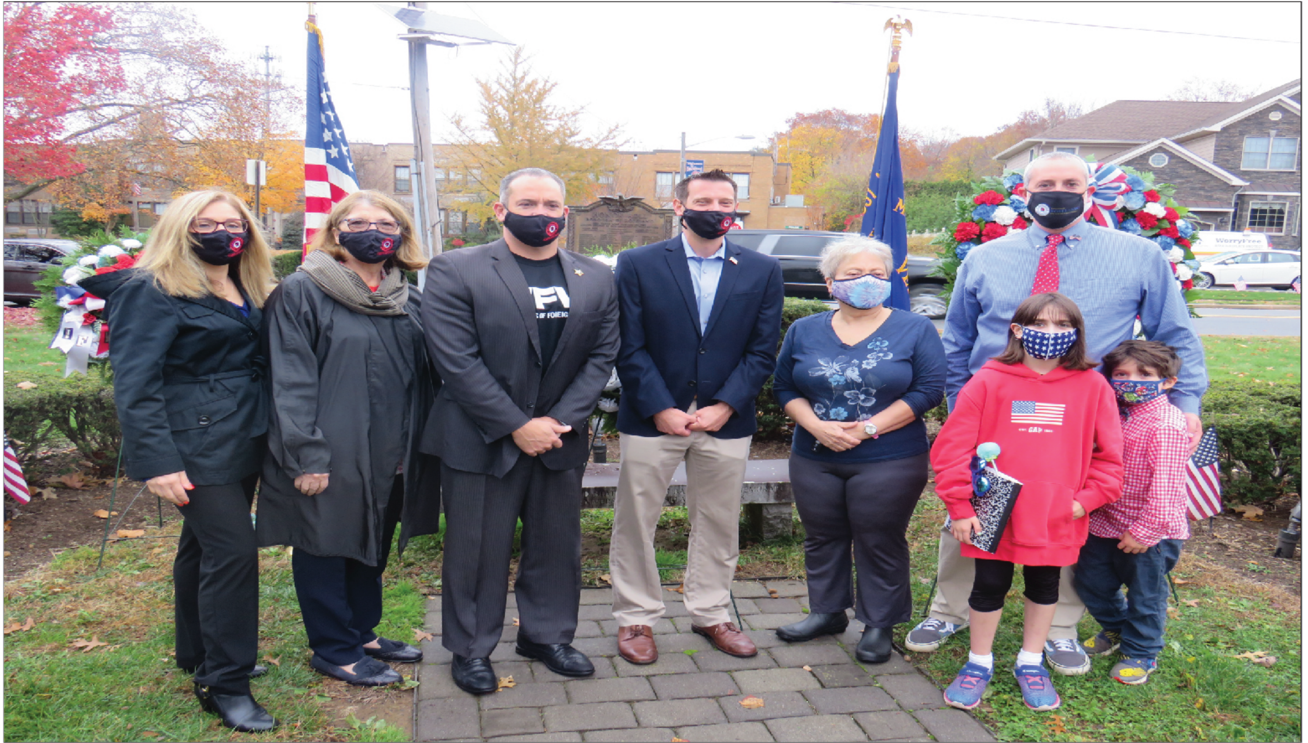
Veteran's Day Ceremony, November 2020